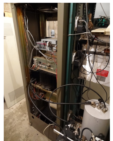
Photo of the installation with test equipment. Pix and write-up provided by Roger WØWUG.