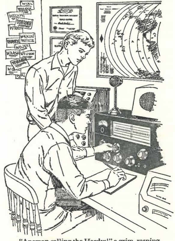
"Apeman calling the Hardys!" a grim, rasping voice announced