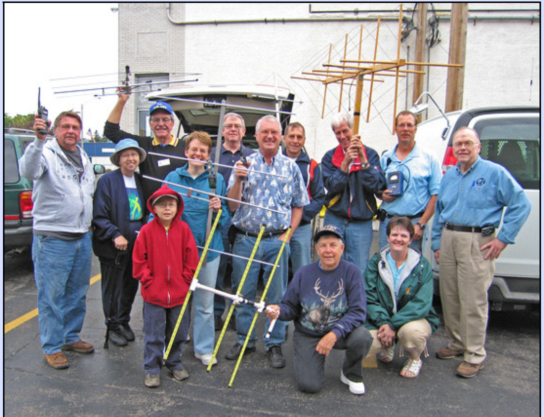
The Annual BAARC Fox Hunt and Picnic was a great success. Details on Page 4 in this BAARCer .