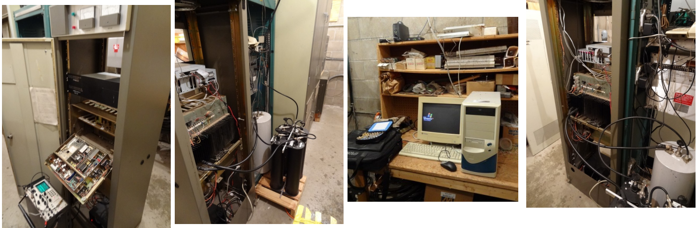
Photo of the installation with test equipment.

Thanks, Guys! The Club Members are grateful for your expert technical work provided on 2-22-12 to keep the BAARC's Main Repeater 147.225 running. Also see p. 8.