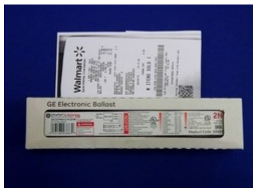
A commercial lighting ballast, sold to a consumer for residential deployment.